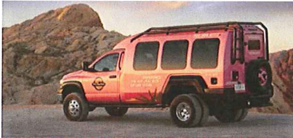
Pink Jeep Tours Unveils the Ultimate Tour Vehicle, the Tour Trekker Jeep October 9, 2008 By Benson Kong

Insurance | Dealers | Auto News | Auto Racing | Tech Topics | Expert Advice | Gear | Consumer | Behind the Scenes | Adventure/Travel Home > Magazine Features > Pink Jeep Tours Unveils the Ultimate Tour Vehicle, the Tour Trekker Jeep